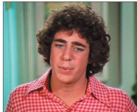
The National Right to Work Foundation has a long, storied history of assisting workers in the entertainment industry, including “Brady Bunch” actor Barry Williams.